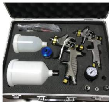
H-777P+MINI H-777P KIT