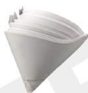
Paper Cone Strainer

Paper Optional: 150g, 180g Strainer: 125 \mu m, 190 \mu m, 226 \mu m, 250 \mu m