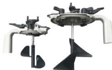
Paint Can Mixing Lid