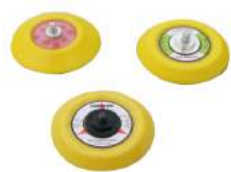
2 3/4" Non-vacuum Pad