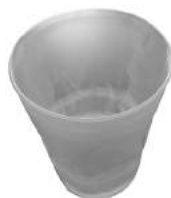
Disposable Paint Tank Liner

Spray Gun Disposable Cup Volume: 650CC Lid: with filter