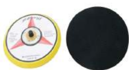
5 7/8" Non-vacuum Pad