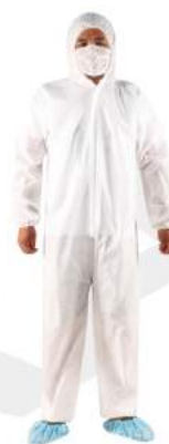
Disposable Spraying Protective Suit

Paper Optional: 150g, 180g Strainer: 125 \mu m, 190 \mu m, 226 \mu m, 250 \mu m