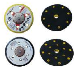
5 7/8" Vacuum Pad